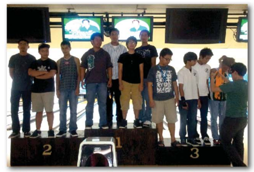
20 I 2 GUAM HIGH SCHOOLS BOWLING CHAMPIONSHIP BOYS TEAM EVENT MEDALISTS: (L-R): 2ND PLACE GEORGE WASHINGTON HIGH SCHOOL, CHAMPIONS SIMON SANCHEZ HIGH SCHOOL AND 3RD PLACE JOHN F. KENNEDY HIGH SCHOOL.